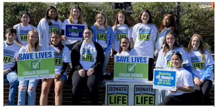
AU COM students at "Hats Off to Organ Donors" event.