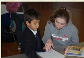
An Alvernia volunteer helps a participants with their homework.