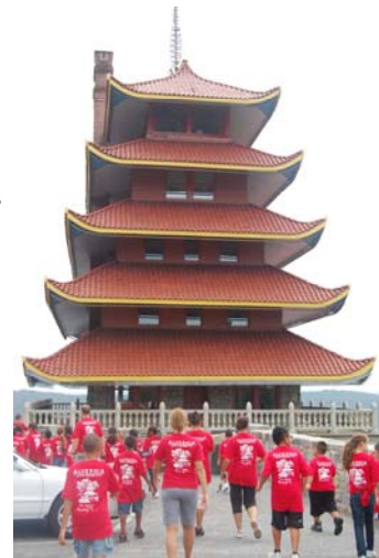
Junior Creativity Camp 2010 "All Aboard: Technology on Track" visits the Pagoda to get a bird's eye view of the City of Reading and the train tracks.

Watch a highlight video from Junior Creativity Camp 2010.