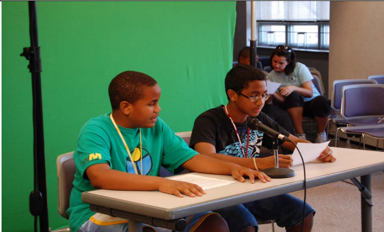
Participants create their own “newscast” during Creativity Camp 2010.