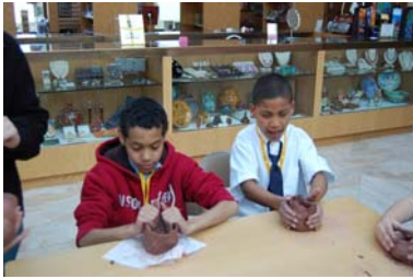
SRYI Participants make clay pots during our visit to the Reading Public Museum in 2009.

The South Reading Youth Initiative will be traveling to the Reading Public Museum starting Monday September 13th and ending on Monday, October 18th. We will leave from St. Peters Church after homework help at 3:45 and return to the church at 5:45pm.