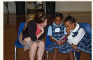
South Reading Youth Initiative participants read with a volunteer.

For more information on the Reading Public Library please visit their website.