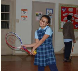
South Reading Youth Initiative participant poses with her tennis racquet during a session at St. Peter's Church.

During 2009 and continuing this year the SRYI participants will partner up with Reading Tennis. Everyone will get a chance to try their own hand at playing tennis. The participants really enjoy the time that they get to spend learning a new sport.