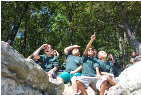
Junior Creativity Camp 2011 participants look for hawks during their trip Hawk Mountain. They had the chance to walk some trails and spot hawks during the visit.