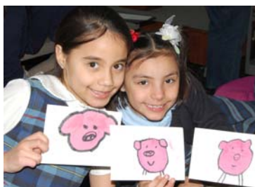
SRYI Participants show of artwork at the Yocum Institute last Spring

The South Reading Youth Initiative will be visited by the Yocum Institute a few days this semester. The Institute has been on of our best community partners since the beginning of South Reading in 2006.