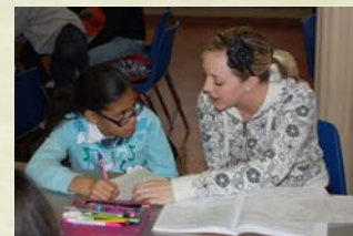
An SRYI volunteer works with a student to complete their homework!