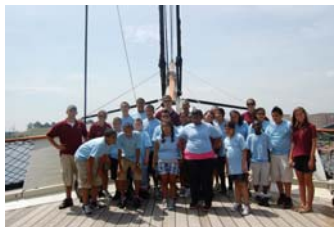
Creativity Camp 2011 Participants onboard the USS Constellation in Maryland.